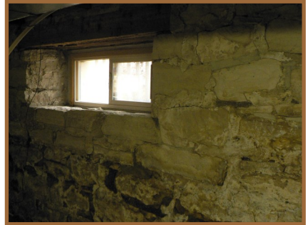
Solid Foundation, West Basement