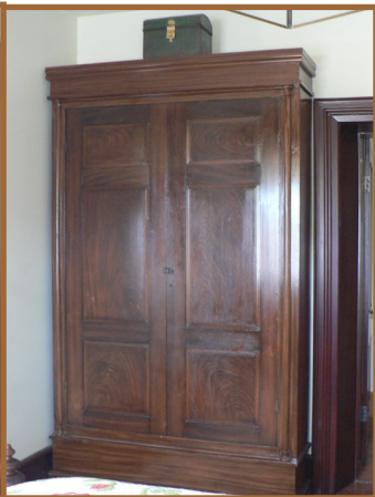
Original, Restored Pieces of furniture