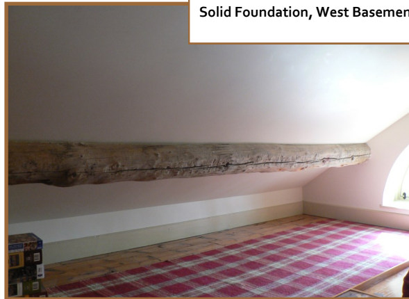
Attic Support Beam