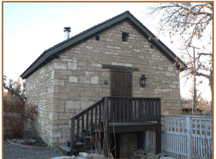
Restored Mary Ann & Orson Hyde Granary