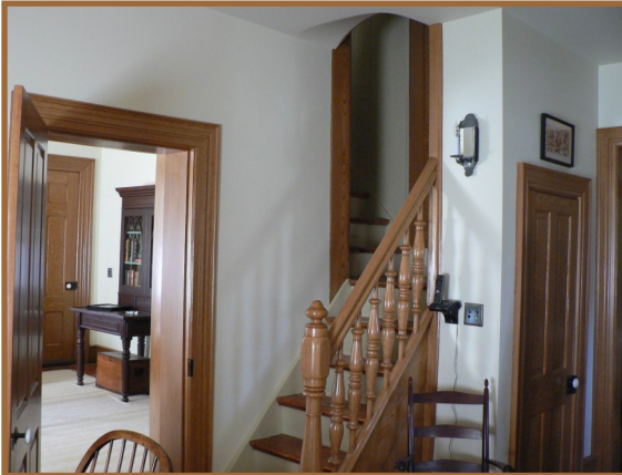
Original Doors, Jambs, Thresholds, Stairs and Stair Rails