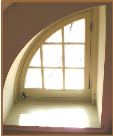
South Attic Window with glass insulators for telegraph

This home was also the Spring City office of the Deseret Telegraph .